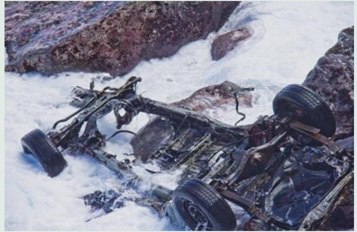
The remains of the minivan that plunged into the sea in St Vincent on Monday.

He noted that commitments have also been made to the children who were in the minibus and their families in respect of their care, comfort and education up to university level; these commitments will be laid out in detail in parliament at an appropriate time. Gonsalves promised no effort will be spared in getting the best medical treatment for those still at hospital both at home and abroad if the latter becomes necessary. Prayers will be said at Westminster Cathedral in London and at the Vatican on Sunday for the people of the multi-island nation. The government is ordering a new school bus to transport children from the northernmost community of Fancy to school; a temporary one will be on the road come Monday. The crisis centres at the Milton Cato Memorial hospital and the Fancy Seventh-day Adventist Church will remain in operation for the immediate future.