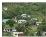
BB270 Fountain, 8,579 sq.ft, ECD$72,000.00