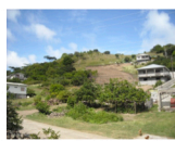
BB151 Union Island, 43,560 sq.ft, ECD$152,460.00