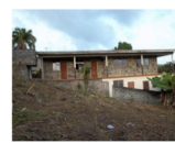
H802 Arnos Vale, 3 bed 3 bath, 4,862 sq.ft, ECD$490,000.00