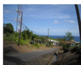
BB701 Chester Cottage, 11,030 sq.ft, ECD$66,000.00